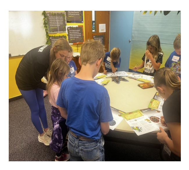
Pictures of the happenings at Vacation Bible School More pictures next time!